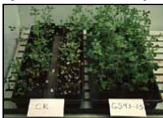
Figure 3. Protection of alfalfa seedlings.

Microbial seed treatments have been tested intensively for promoting growth and reducing disease in other crops. However, few microbials have been tested for alfalfa. Many of the microbial seed treatments currently on the market require warm soil temperatures for the microbe to be active, which may not occur when alfalfa is planted. Streptomycetes are common soil bacteria that can inhibit plant pathogen growth and promote plant growth across a broad range of temperatures. Streptomycete isolates were tested for control of PRR in naturally infested field soil. Strain GS93-23 significantly reduced disease symptoms compared to the control (Figure 3). This strain also increased plant biomass in the absence of the pathogen and inhibited growth of Aphanomyces , Pythium , and other alfalfa pathogens in agar plate assays. Results suggest that in addition to potential for controlling alfalfa root rot, Streptomycetes may be useful in integrated control against diverse soilborne plant pathogens.